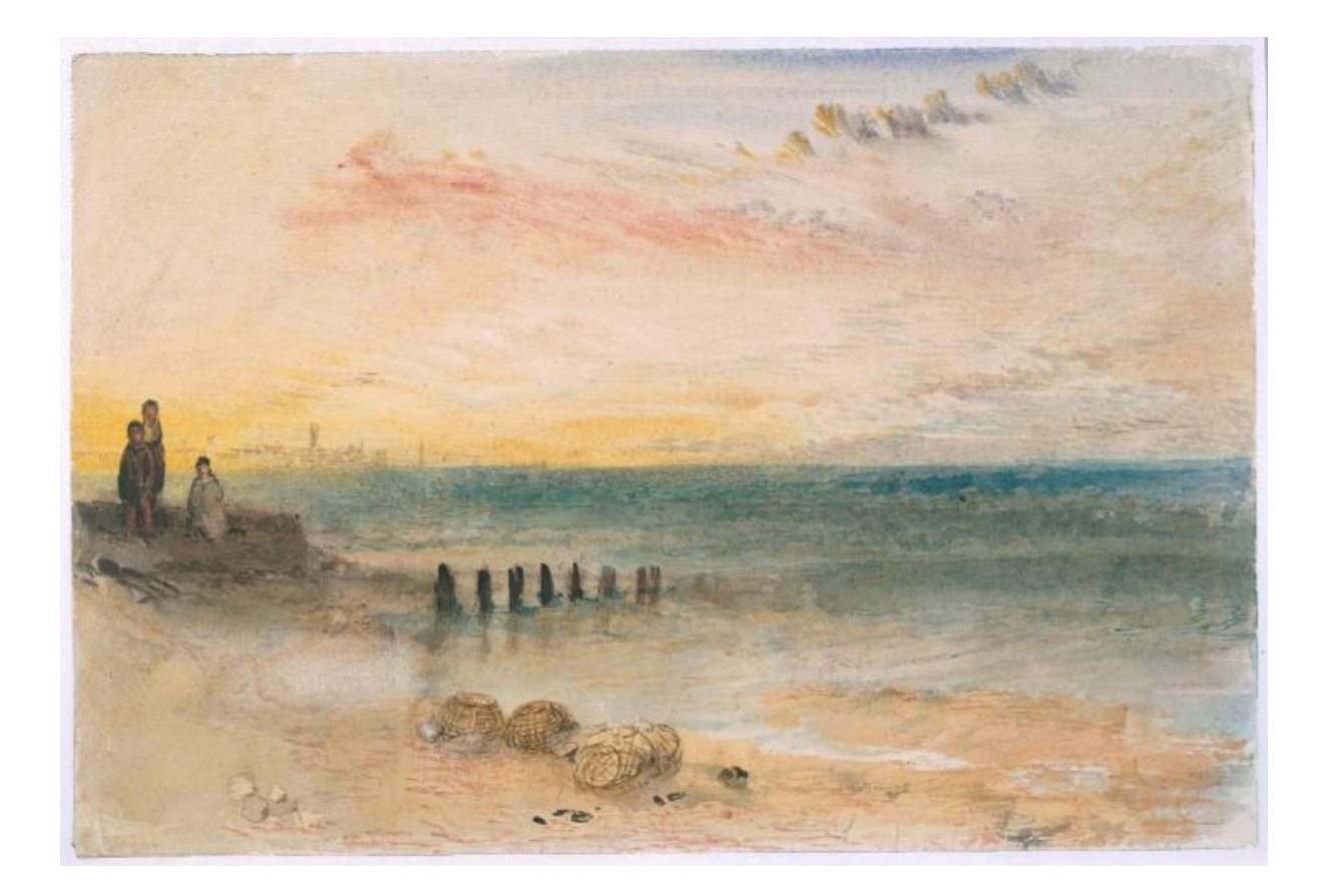
Illustration 9: Joseph Mallord William Turner, 'Yarmouth, from near the Harbour's Mouth', c.1840.

In starting the blog I hoped to discover ancestors of these boys and other individuals and families whose histories I reconstruct through the penal and parish registers, for this is one method I use to analyse patterns of re-offending and desistance and to assess the impact of the visitor's 'rehabilitation' programme. It is also among a number of reasons I do not anonymise the individuals I examine, not least because the research is based on documents in the public domain. I am pleased that descendants contacted through genealogy sites enjoy reading my blog and say it does justice to their family history. While the ethics of identifying individuals in the criminal justice record was raised at the first meeting of Our Criminal Past, it seems to me there is no reason to treat the issue any differently in blogging than in scholarly publication.<sup>32</sup> Caution and sensitivity should be taken when dealing with the recent past and within the life-time of those affected, or cases involving criminal insanity, but practice can be guided by existing protocols developed within the discipline, notably