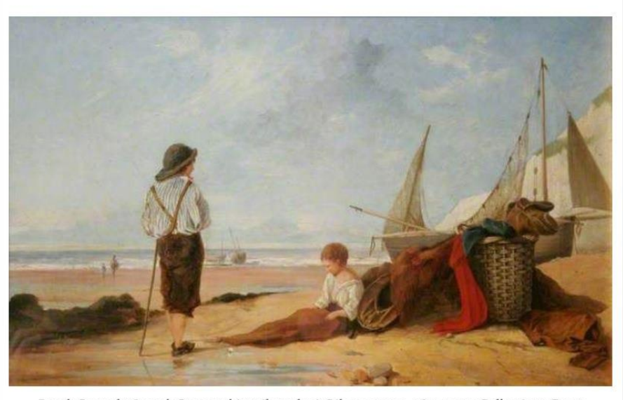
Beach Scene by Joseph Stannard (attributed to) Oil on canvas, 26 x 43 cm Collection: Great Yarmouth Museums

Illustration 7: Helen Rogers, <u>'Grey Cotton Shirts'</u>. 'Beach Scene', attributed to Joseph Stannard. (accession number GRYEH: 2005.86).