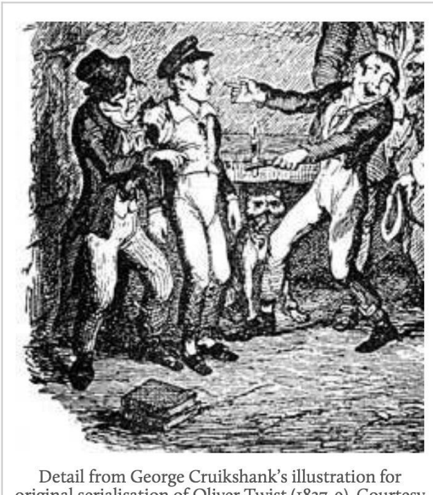
original serialisation of Oliver Twist (1837-9).