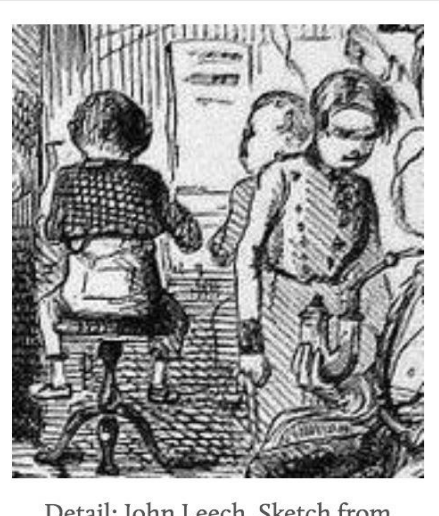
Detail: John Leech, Sketch from Punch 1849: How to make the culprits comfortable; or, hints for Prison Discipline

Illustration 4: Helen Rogers, <u>"And have you brought the combs?"</u>. Detail from 'How to Make Culprits Comfortable', Punch , 1849.